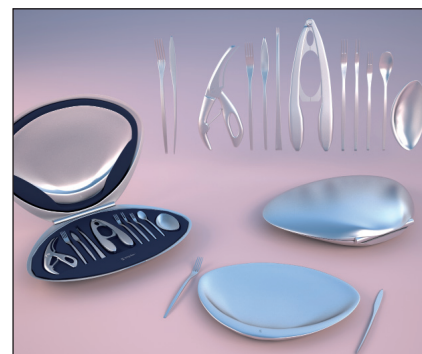
3 rd Prize 3,000 € worth of Zepter products