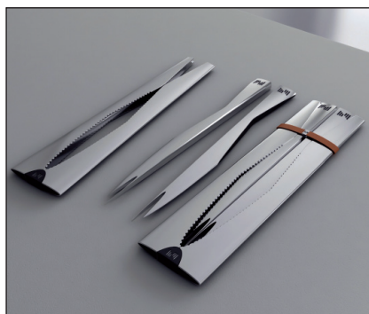
2 nd Prize 4,000 € worth of Zepter products

Gianmarco Brunacci and Luca Zenobi – Italy